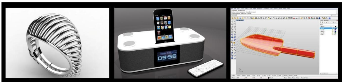
Above: a sample of works created by Year 9 students in Graphics Technology