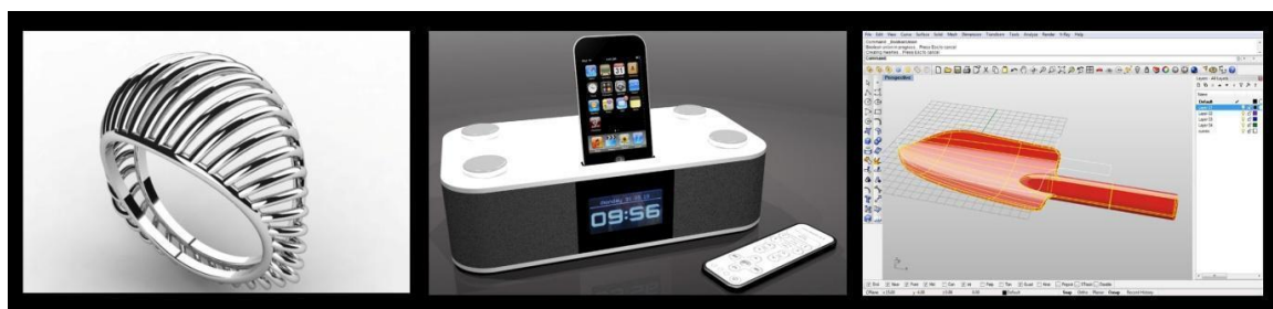
Above: a sample of works created by Year 9 students in Graphics Technology