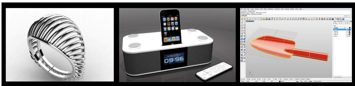
Above: a sample of works created by Year 9 students in Graphics Technology